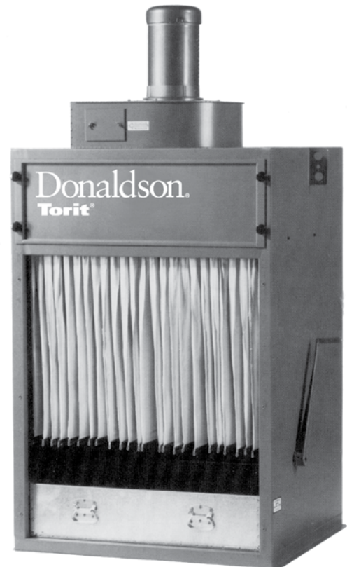
Cabinet 90 (door not shown)