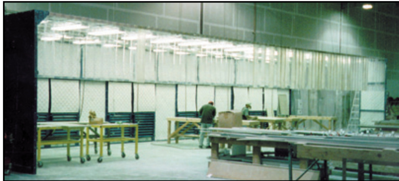
Environmental Control Booth

Donaldson's ECB works by creating a self-contained working environment complete with lighting, sound proofing and built-in dust collection. Workers inside the booth enjoy complete freedom of movement, cleaner air and excellent visibility. Using Ultra-Web filter media with our proprietary nanofiber technology, the powerful filtration capabilities of ECB prevents migration of dust to other parts of the plant, protecting workers outside the booth from the dust and noise generated inside the booth.