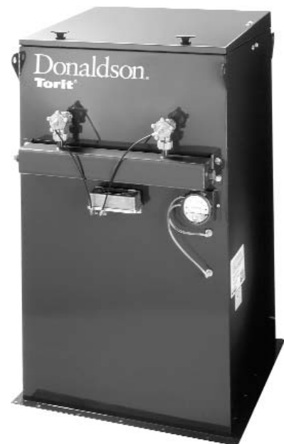
TBV-4 with Plenum

Designed for easy filter service and maintenance—no tools required