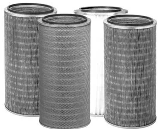
Ultra-Tek®, Ultra-Web®, Torit-Tex™, and Fibra-Web®